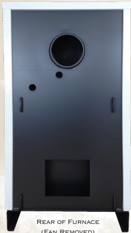
REAR OF FURNACE (FAN REMOVED)