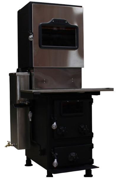
SF250 With Off Grid Accessories

Off grid and reduced power heating options are becoming ever more popular. Legacy Stoves has responded with off grid options for the rugged and reliable SF250. These include a stainless steel cook top (left), an oven (right) and stainless steel water heating tank (above). The rear-mounted fan improves stove heating capacity and efficiency, and has low current requirements. The SF250 can be operated without this fan, and without electrical power, if desired.