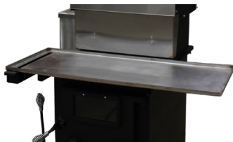
Stainless Steel Cooktop

Off grid and reduced power heating options are becoming ever more popular. Legacy Stoves has responded with off grid options for the rugged and reliable SF250. These include a stainless steel cook top (left), an oven (right) and stainless steel water heating tank (above). The rear-mounted fan improves stove heating capacity and efficiency, and has low current requirements. The SF250 can be operated without this fan, and without electrical power, if desired.