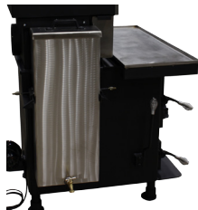
Side-Mounted Water Heating Tank