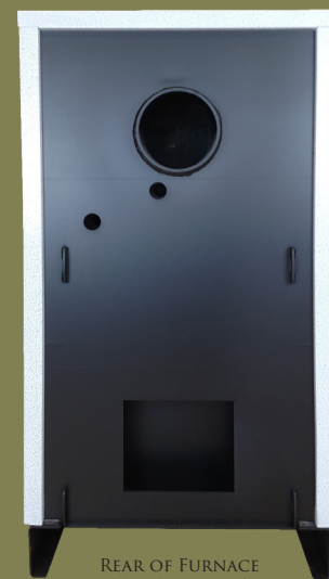
REAR OF FURNACE (FAN REMOVED)